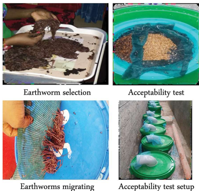
Fig. 1. Photographs of experimental setup of earthworm culture

from the old to the new substrate was counted after 1, 2, 12 and 24 hours. This procedure was repeated after pre-composting the substrates for two weeks. The pre-composting was done by sprinkling the substrates with water then turning them after every 48 hours.